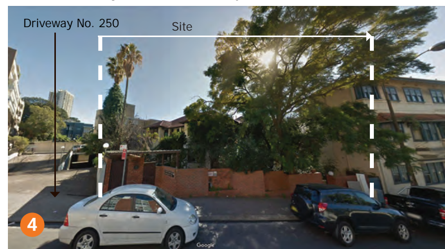
Subject site viewed from New South Head Road (Google Streetview).