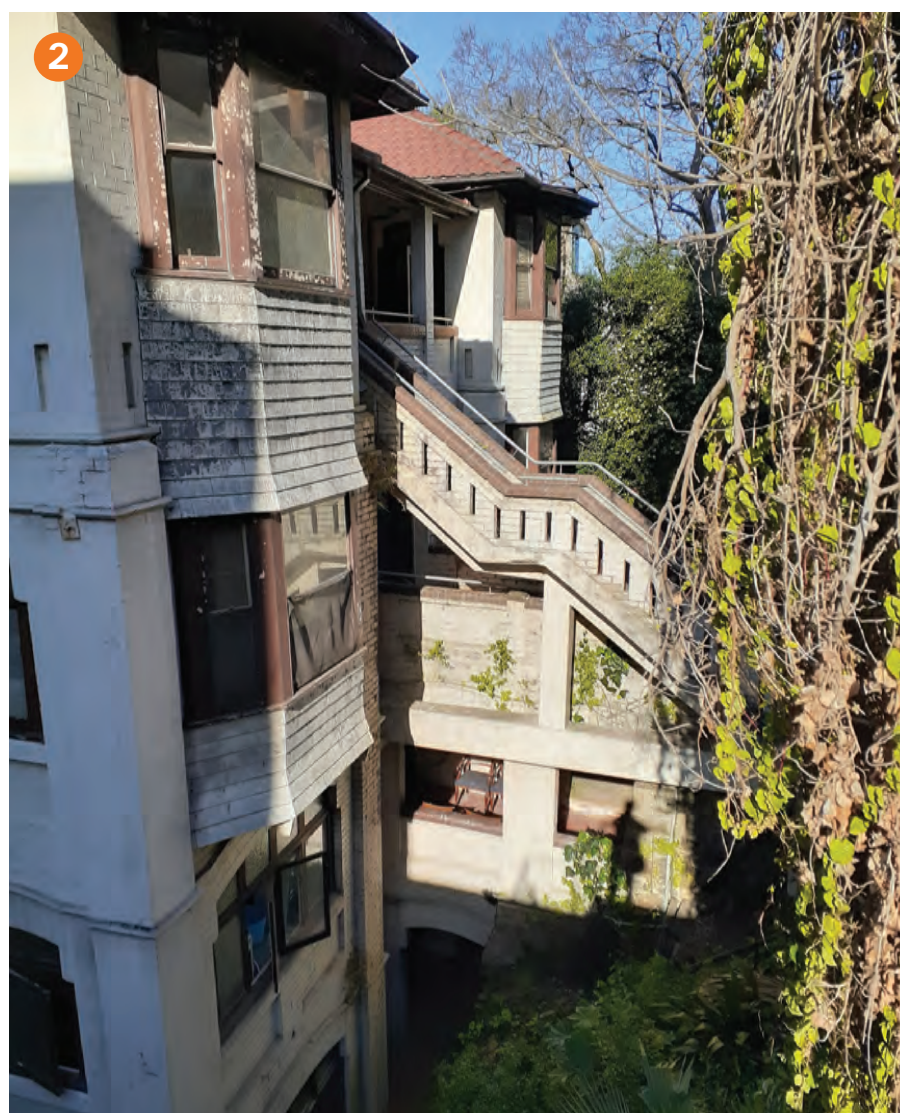
View looking east along the southern boundary (front) of the subject site.