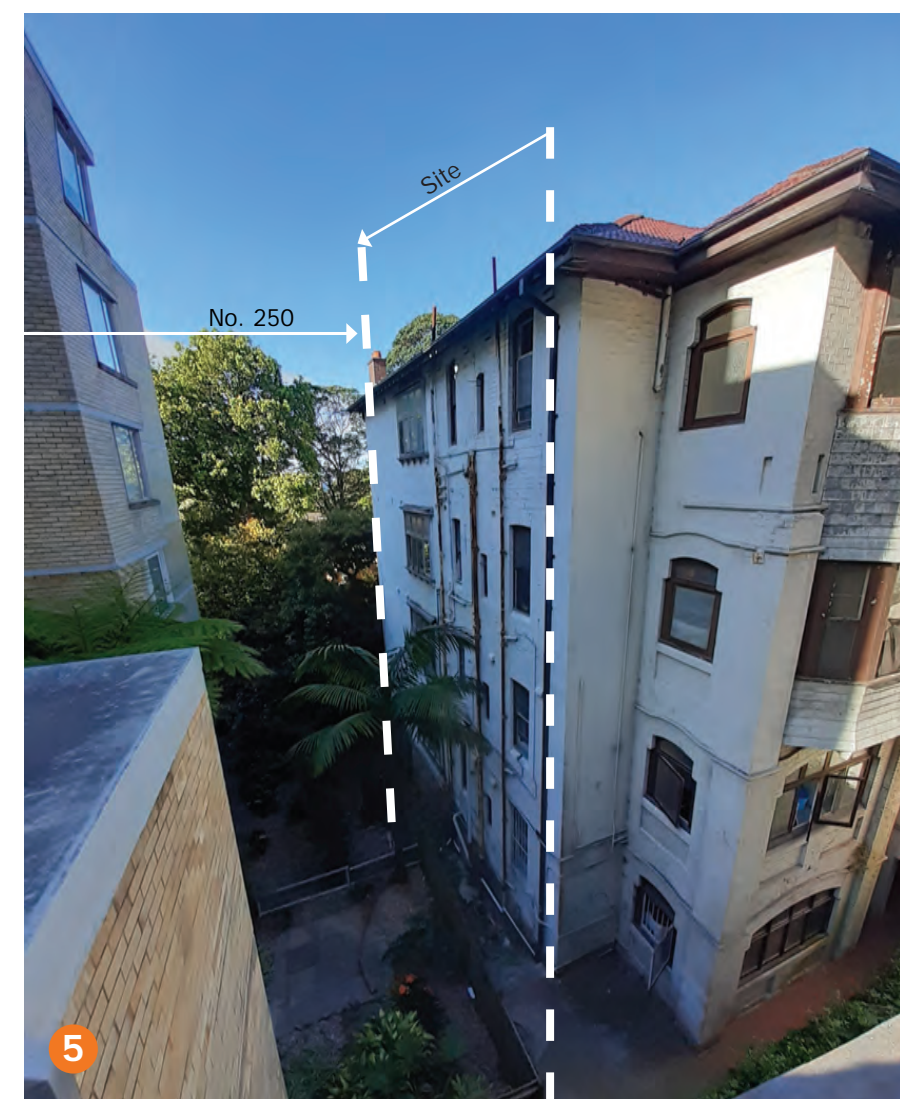
View along the western boundary.